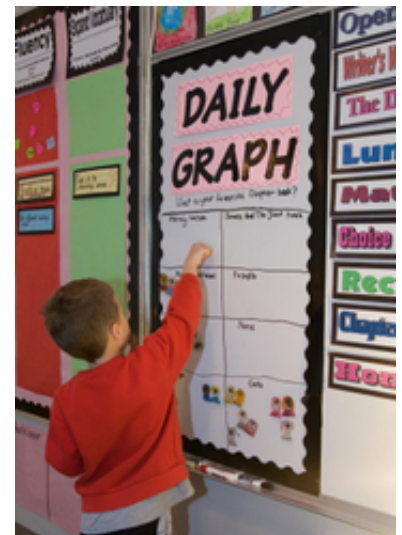
The Daily Graph is created each day by students. Kids move their magnets on the graph as part of their morning ritual.

As the years have passed, we've also tried to make our classrooms more ecologically friendly. Keeping the same background paper and borders